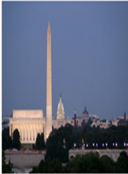
The Washington Monument.