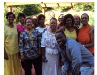
Attendance at the DC Chapter holiday Soiree—Kendejah Lounge, Washington, D.C.